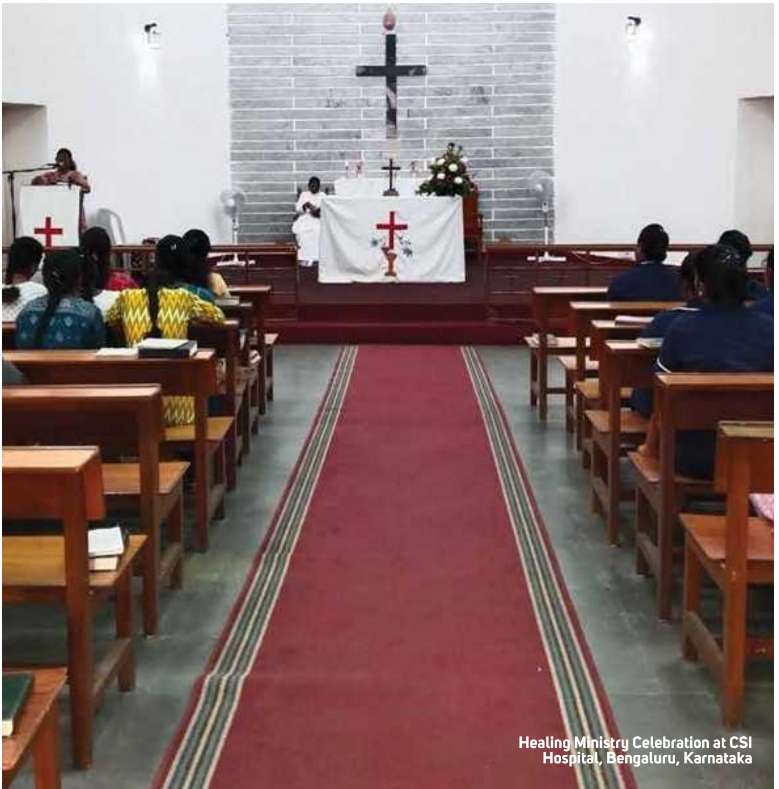
Healing Ministry Celebration at CSI Hospital, Bengaluru, Karnataka

A Quarterly Newsletter of Christian Medical Association of India